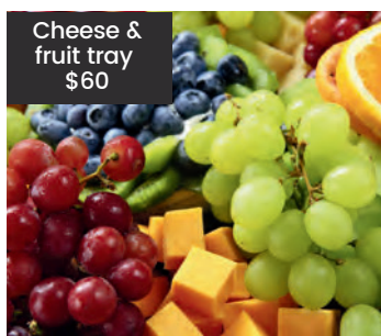
Cheese & fruit tray $60