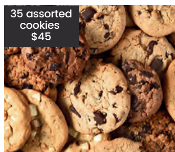
35 assorted cookies $45